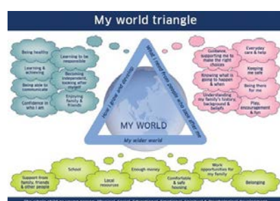
Figure 2. My World Triangle (www.gov.scot)

Building resilience involves the development of internal characteristics and coping strategies that decrease the psychological impact of negative life events. However it also involves external factors to do with our relationships, family, and socio-demographic status. For example having a supportive and consistent family network, opportunities to engage in the community, to develop hobbies, confidence, and self-esteem, may all mitigate the negative impact of experiencing adverse life events.